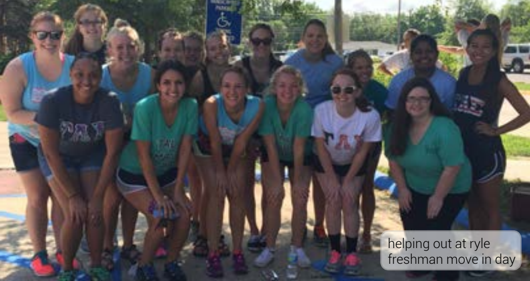
helping out at ryle freshman move in day