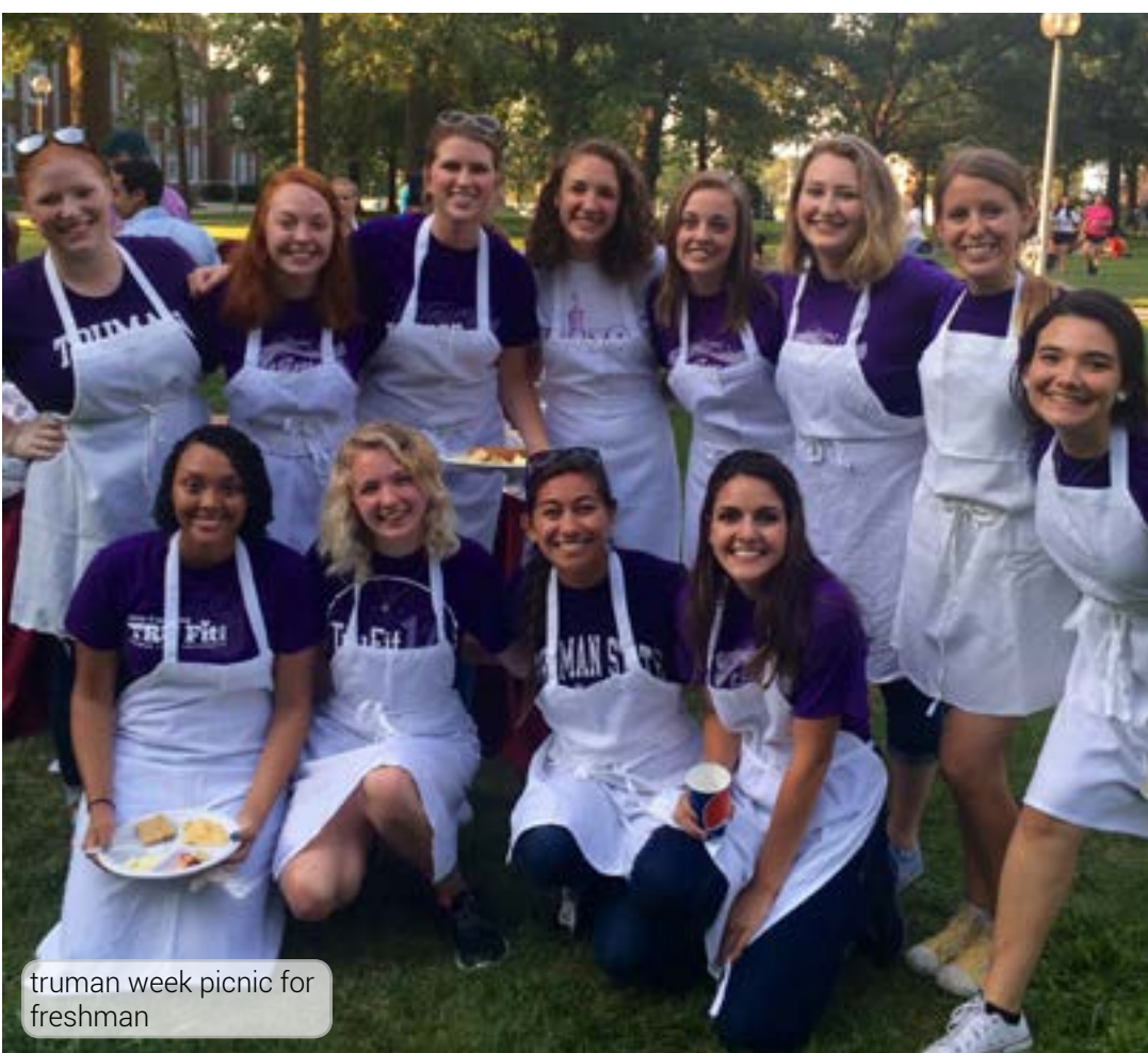
truman week picnic for freshman