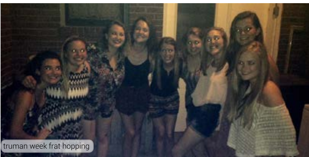
truman week frat hopping